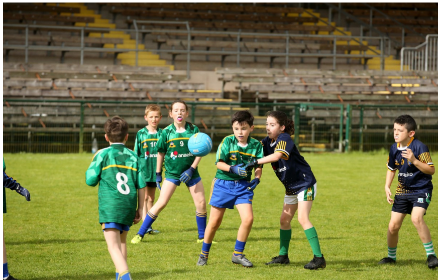
Action from the popular Urban League.

Outside of the Street League, training for the U11.5s continued on Thursday evenings and Saturday afternoons in preparation for what we believed would be the rescheduled commencement of our league on 10th October. We squeezed in a couple of challenge matches to develop a competitive edge but, as we all know, everything got halted again in the first weekend in October, and the league now looks very unlikely to happen at all in 2020.