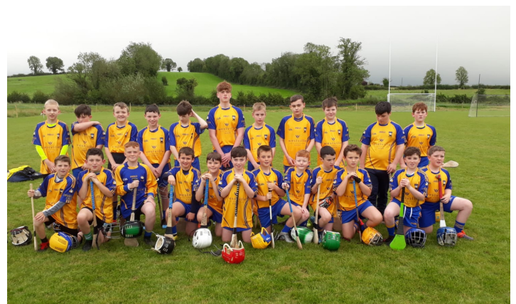
Our U13 hurlers are pictured before their Boston Cup final.