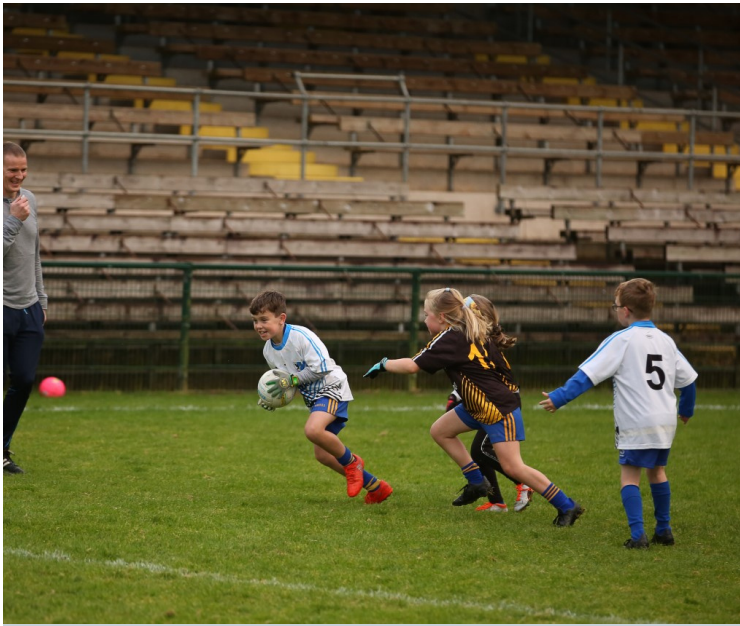
Action from the Junior Street League.