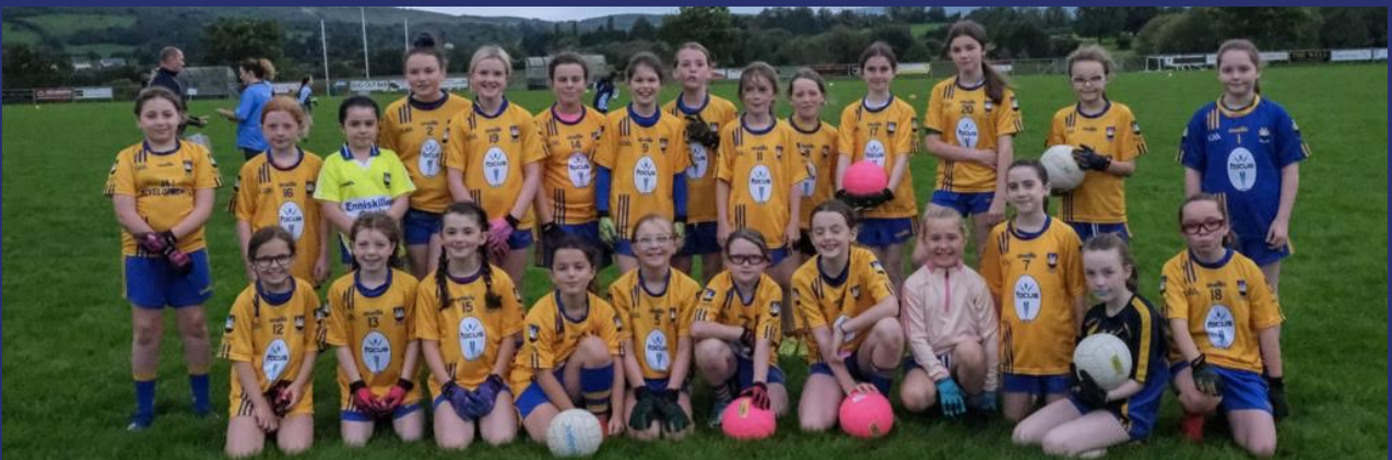
The Enniskillen Gaels Ladies U11.5 squad.