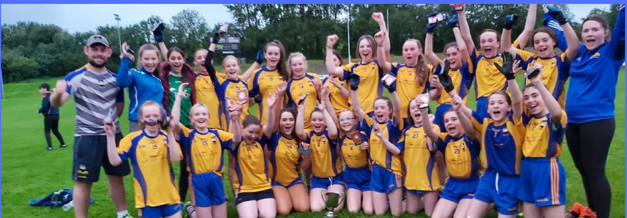
The victorious Gaels U14 Girls side who won the Division Three title.