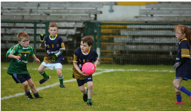
Action from the Junior Street League.