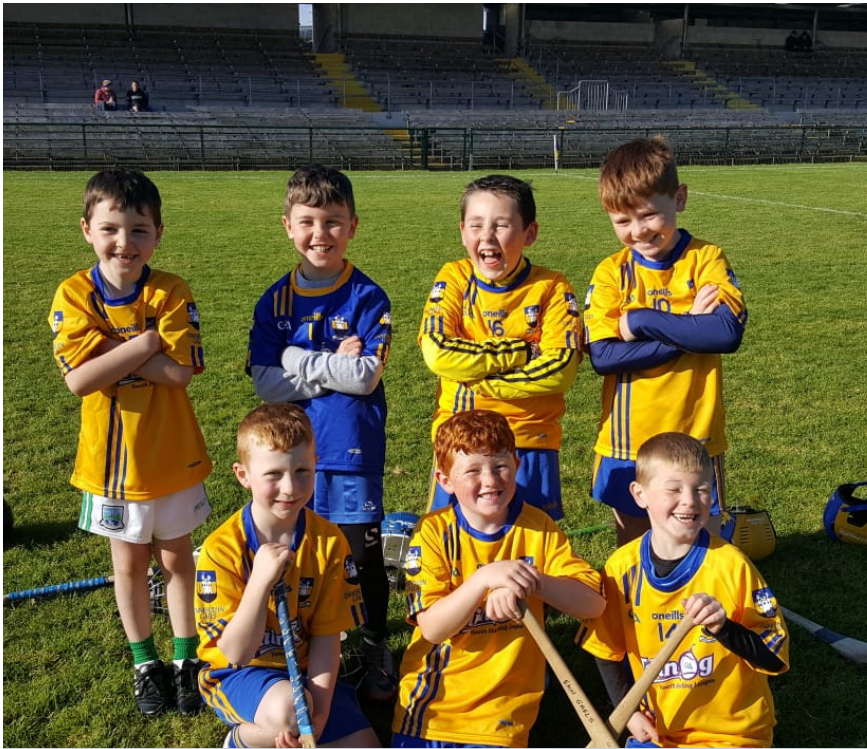
The U8s enjoying their game against St. Aidan's.