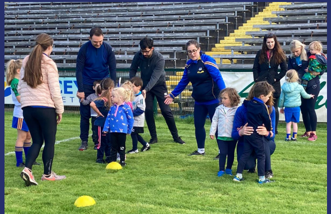
The U6s enjoyed the coaching on Saturday mornings.