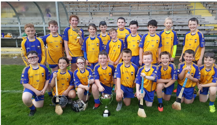
Our U11.5 hurlers pictured with the Queens Cup following their victory over Lisbellaw in the final.

Again, unfortunately, Covid stopped their activities this year. Both lads fully deserved their position in the squad after going through three trials before we cut the squad from 45 to 32 players.