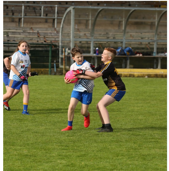
Action from the popular Urban League.

The coaches would like to thank all the players for their commitment and efforts.